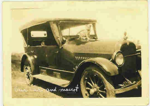
Gus Scena memories